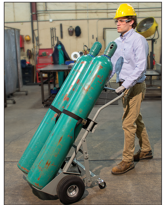
Double cylinder hand truck holds gas cylinders in place independently for improved safety.