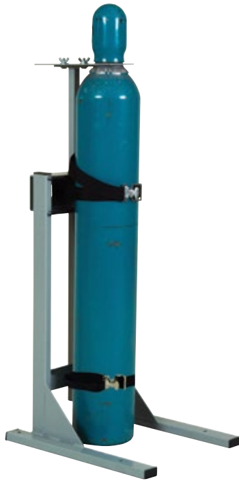
Model 35286 cylinder stand features a locking collar and post system to immobilize cylinder for safe over-the-road transport.

Portable storage stands for the safe transport of compressed gas