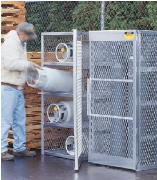
Durable, weather resistant aluminum construction offers long-lasting, safe storage of LPG and compressed gas cylinders.