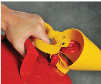
Comfortable trigger handle