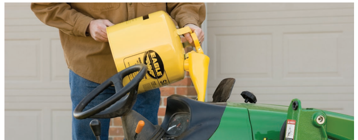
Optional HDPE funnel aids pouring into small openings