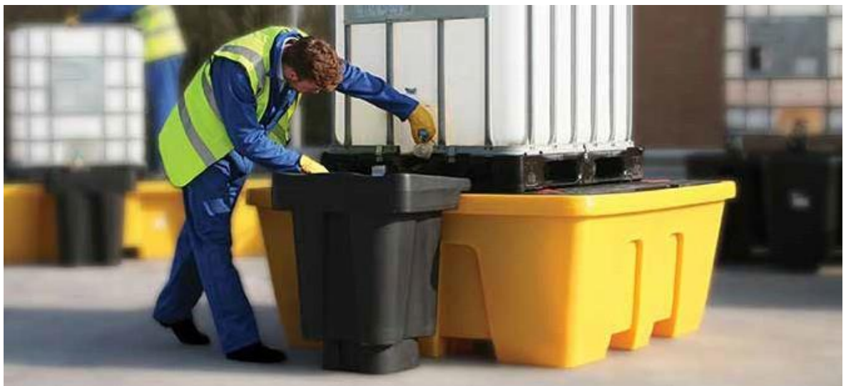
Application image for illustration purposes only. Additional items shown are not included. Color is as image shown at the top of the page.