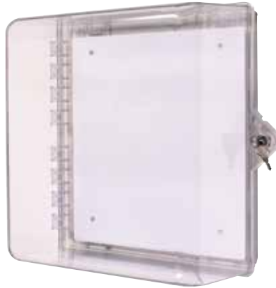
STI-7530 with Key Lock