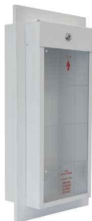
Optional Recessed Frame